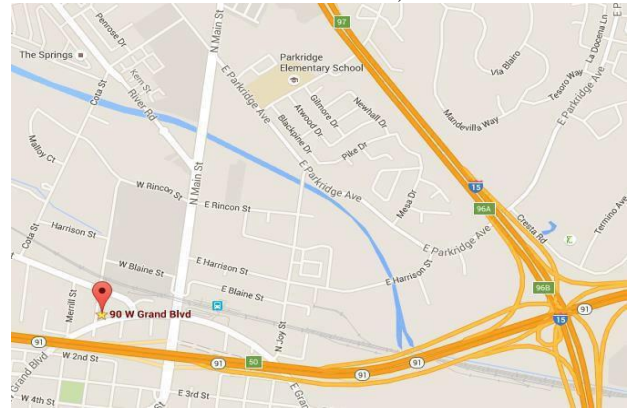
*Our major cross streets are W. Grand Blvd. and Railroad St. Corona Office Hours: Monday through Fridays from 9:00am to 4:30pm. Saturdays from 9:00am to 2:00pm.

PTHC Main Campus: Corona, CA Campus Location: 90 W. Grand Blvd Suite 107 Corona, CA 92882